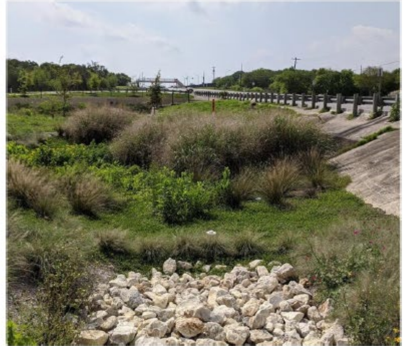
Bioretention at Lackland Gateway Corridor