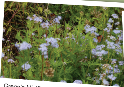
Gregg's Mistflower - Conoclinium greggii