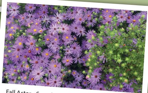
Fall Aster - Symphyotrichum oblongifolium