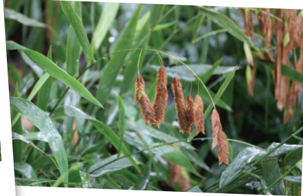
Inland Sea Oats - Chasmanthium latifolium