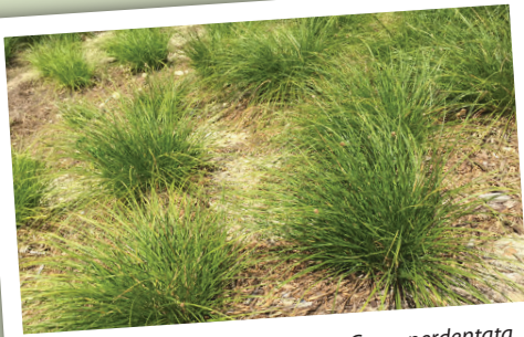
Webberville sedge - Carex perdentata