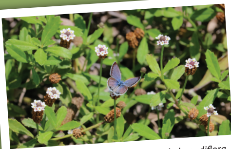
Frogfruit - Phyla nodiflora