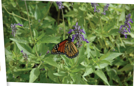
Mealy Blue Sage - Salvia farinacea