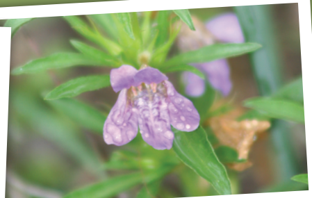
Snake Herb - Dyschoriste linearis