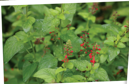
Scarlet Sage - Salvia coccinea