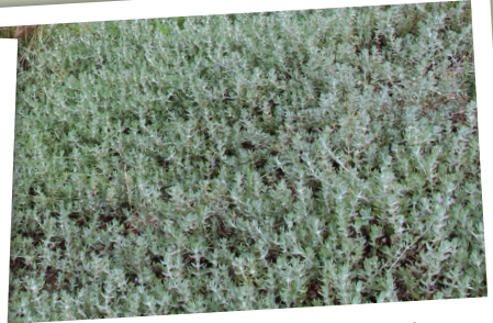
Woolly Stemodia - Stemodia lanata